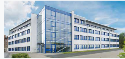
Headquarters Aachen, Germany